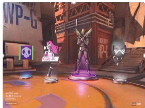
Loot box opening in Overwatch video game