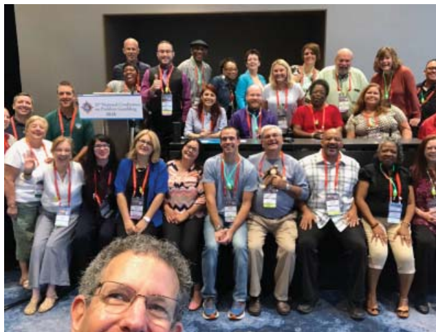
Members of the National Council on Problem Gambling Prevention Committee at the National Conference on Problem Gambling in 2018. The Committee represents a core group of individuals who plan, promote, implement, and advocate for problem gambling prevention and awareness services in the U.S. and Canada. Visit: www.ncpgprevention.org

While youth gambling is seen by parents as not as harmful of an issue and a low priority to address compared with many other behaviors (Campbell, Derevensky, Meerkamper & Cutajar, 2011), concerns about youth video gaming are inarguably on the rise and the 2019 official classification of video gaming disorder in the 11th edition of the International Classification of Diseases (ICD-11, World Health Organization) gives additional credence to the need to address video gaming. There is much to be gained in leveraging public interest in problematic video gaming with youth problem gambling prevention efforts. Initiatives such as those developed in Ohio ( https://changethegameohio.org/ ), Oregon ( www.preventionlane.org/gaming ), and Ontario, Canada ( https://learn.problemgambling.ca/ ) use available data to develop material aligned with evidence-informed problem gambling prevention practices.