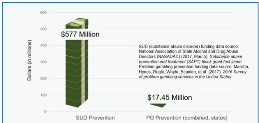
Spending on Substance Use vs. Problem Gambling Prevention Services in the U.S. (Marotta et al., 2017)